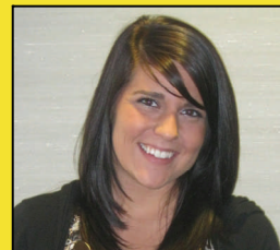
Ariel 230 Suites 229 - 236