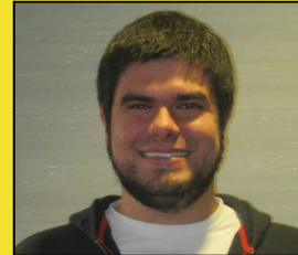
Felipe 404 Suites 400 - 409