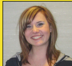
Sam 304 Suites 300 - 309