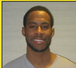
DaMario 204 Suites 200 - 209