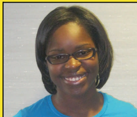
Shay 104 Suites 100 - 108