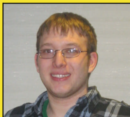
Jeffery 139 Suites 134 - 139