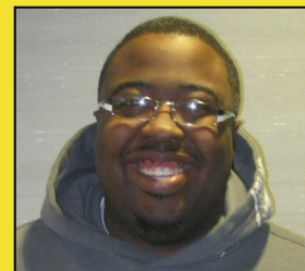
Mario 422 Suites 415 - 427