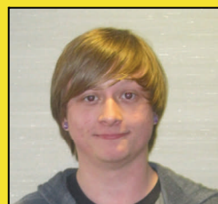
Jeremy 330 Suites 329 - 336