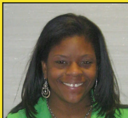
Gabrielle 222 Suites 215 - 227