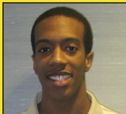
Charles 148 Suites 141 - 148