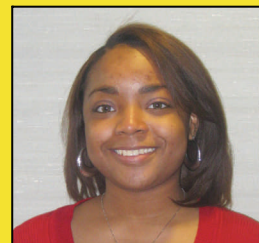
Tara 322 Suites 315 - 327